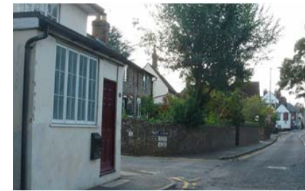
The entrance to Bell Lane from the High Street

The easiest way is from the High Street and look for Bell Lane. It's a quite hard to see as the entrance to the road is small, but is one-way going up from the High Street. 100 meters up Bell Lane, almost opposite 'Loxley Road' you'll find a steep entrance to the social centre. A small dirty track on the left takes you past some garages. St. Johns Ambulance Hall is 50m along on the right hand side.