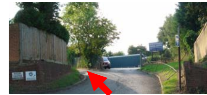
Follow this track past the Social Centre